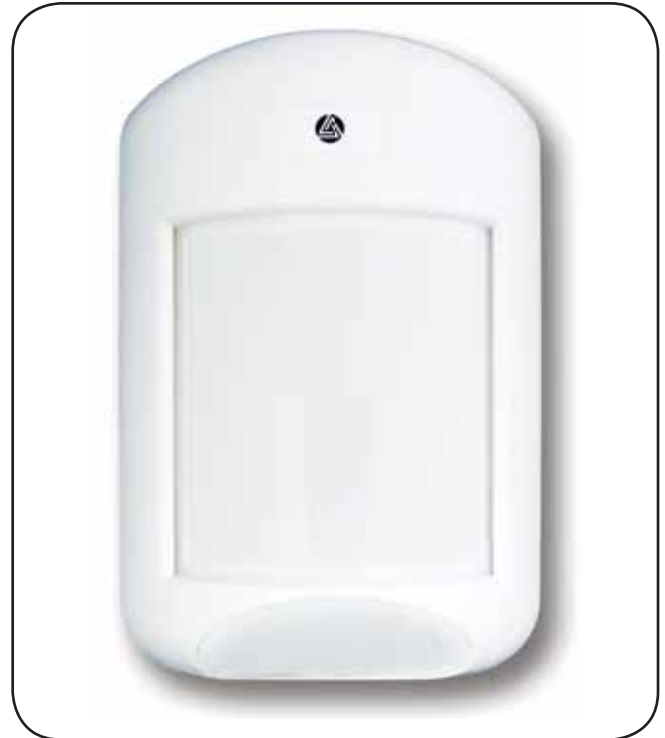
AL40 SERIES PIR INTRUSION DETECTORS

The LED can be fully disabled by removing the LED jumper.